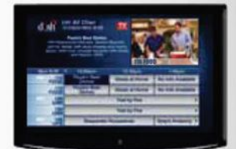
The Program Guide appears.