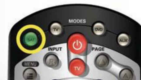
The SAT button lights up.