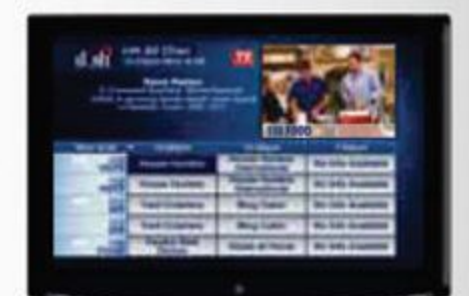
The Program Guide moves up or down.