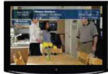
A TV picture appears.