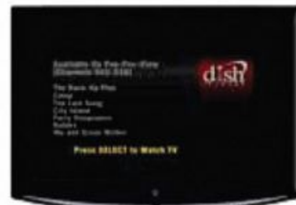
The screen saver appears whenever your receiver is OFF to remind you that your TV is still ON.