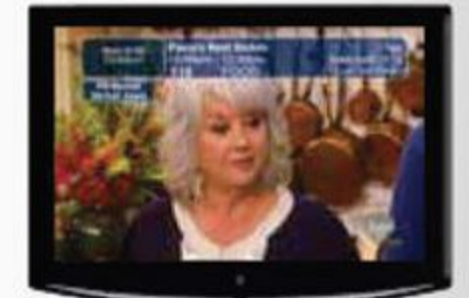
The TV channel changes.