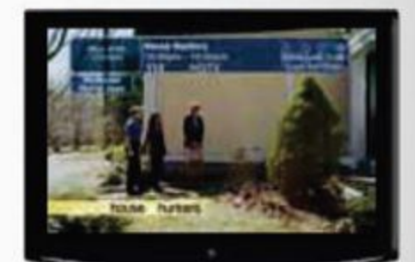
The TV changes to the highlighted channel.