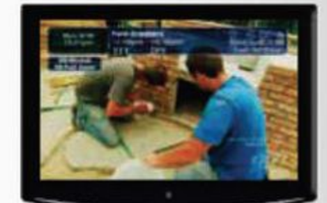
The TV channel changes.