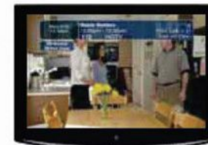
A TV picture appears.

If the picture is not restored, change your TV to channel 3 or 4 using your TV remote or the TV itself.